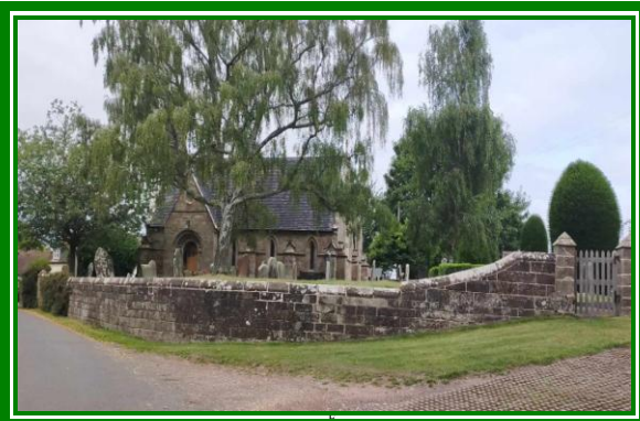
Elmbridge Church

Sunday 6 th October 2024 Toby Carvery, Bath Road, Worcester, WR5 3HW